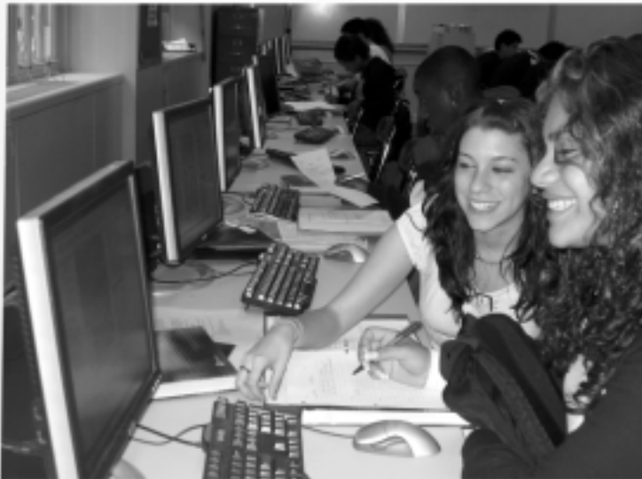
The Municipal Art Society Planning Center trains youth to use Geographic Information Systems technology in community decision making. These young people go on to become map technicians at community boards across the city.