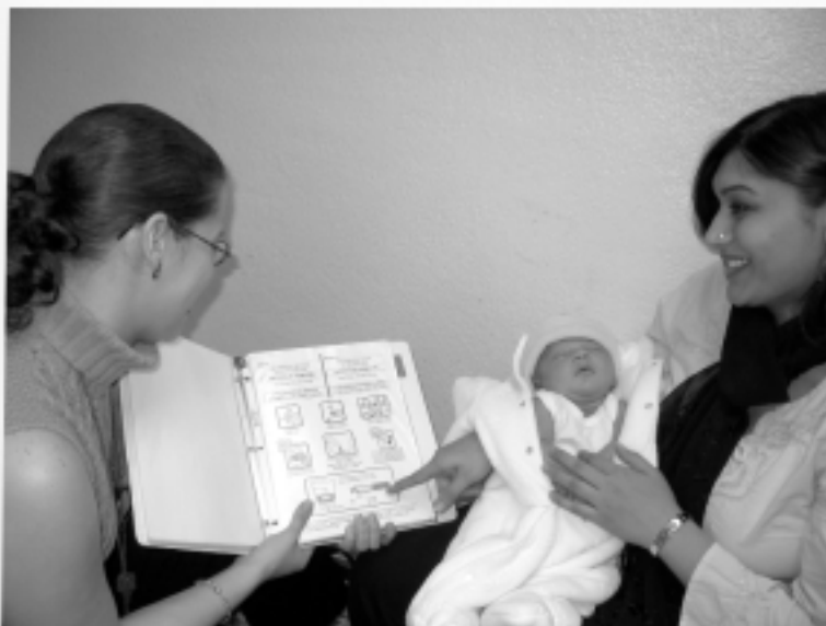
Through the Limited English Proficiency Program, the Health and Hospitals Corporation (HHC Foundation) is experimenting with providing easy-to-understand medication sheets using pictograms and instructions in multiple languages to support safe medication usage.