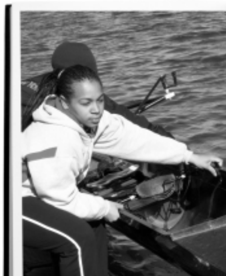
Row New York pairs academic support with a competitive rowing program that teaches discipline, dedication, teamwork, and leadership skills to underserved adolescent girls.

To help support a highly structured competitive rowing and academic program for inner-city high school girls $20,000