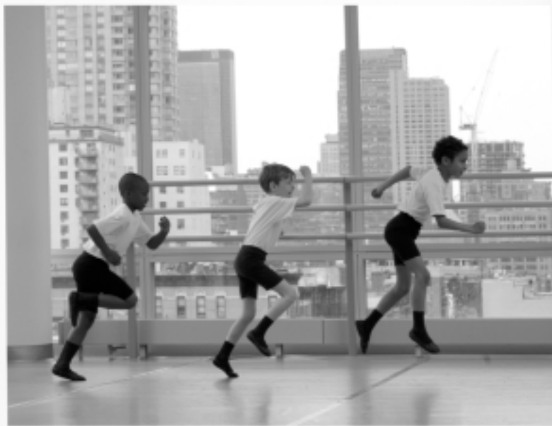
The Alvin Ailey Boys' Program (now called Athletic Boys) introduces young boys to dance and helps them transition into Ailey's mainstream dance classes.