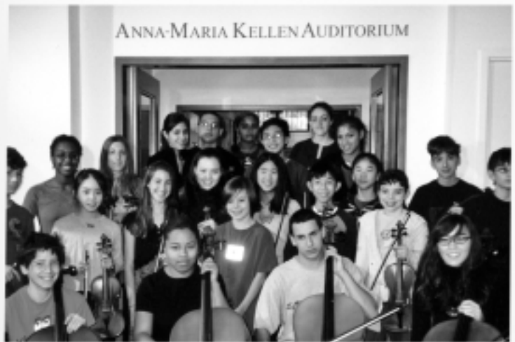
Through the Performing Arts Comprehensive Training Program, Third Street Music School Settlement nurtures and builds upon the skills of its most motivated and talented students.

To help support BYCA's Choral Music Education and Performance Program in New York, and to