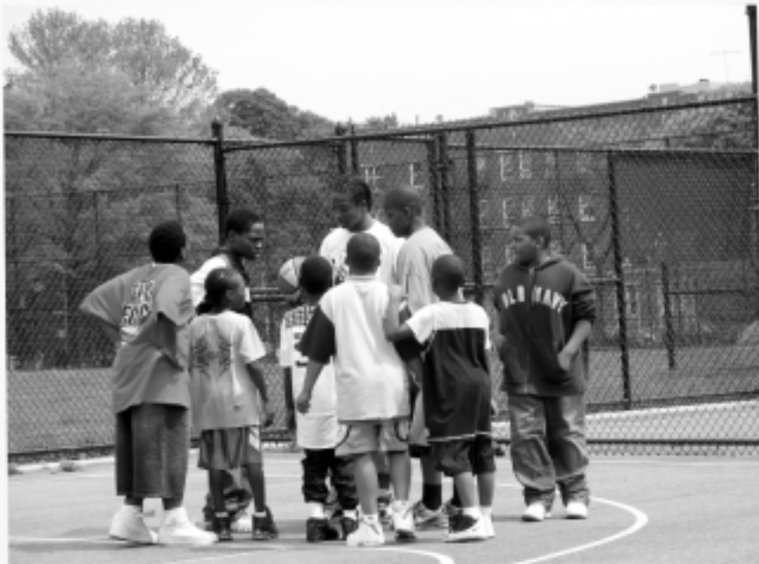
Prospect Park Alliance trains young people to become community leaders through the Youth Council program. Here, Youth Council members organize a basketball game in the park for local children.