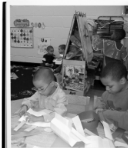
Brooklyn Kindergarten Society's Partnership for Literacy Success Program works to improve outcomes for children by building teacher competency, parental engagement, and social service offerings for its students.

CATHOLIC CHARITIES DIOCESE OF BROOKLYN AND QUEENS www.ccbq.org To help support the Caritas Montessori Teacher Training Center $25,000