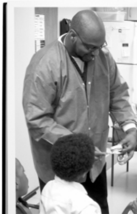
The Children's Health Fund's Healthy Connections program offers individualized assessment and care coordination for children residing in Central and West Harlem. Here, a dentist teaches a young child about proper brushing techniques.