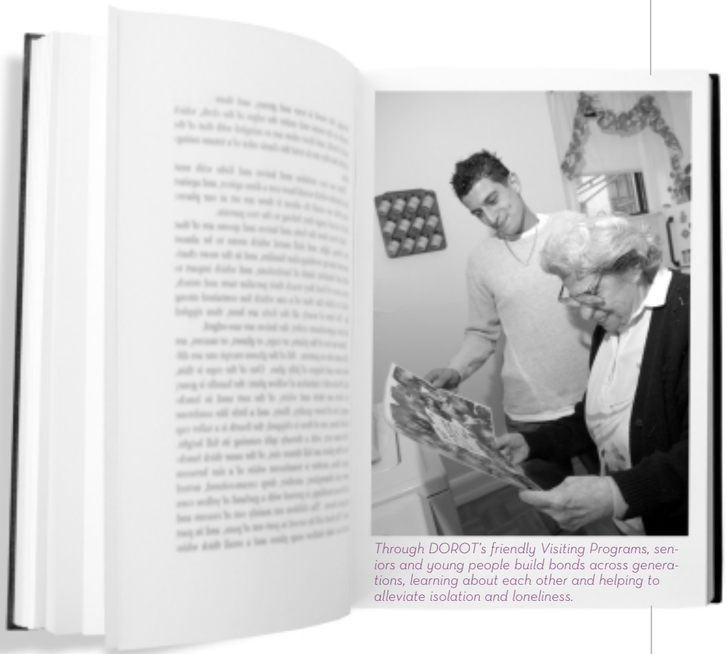
Through DOROT's friendly Visiting Programs, seniors and young people build bonds across generations, learning about each other and helping to alleviate isolation and loneliness.

To promote and sustain the availability of, and equitable access to, essential community resources needed to support stable, healthy communities