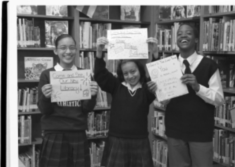
Inner City Scholarship Fund/Patrons Program: Through Library Connections, the Patrons Program works with Archdiocesan inner-city schools to help them develop their library programs and collections and increase library use by students and teachers.