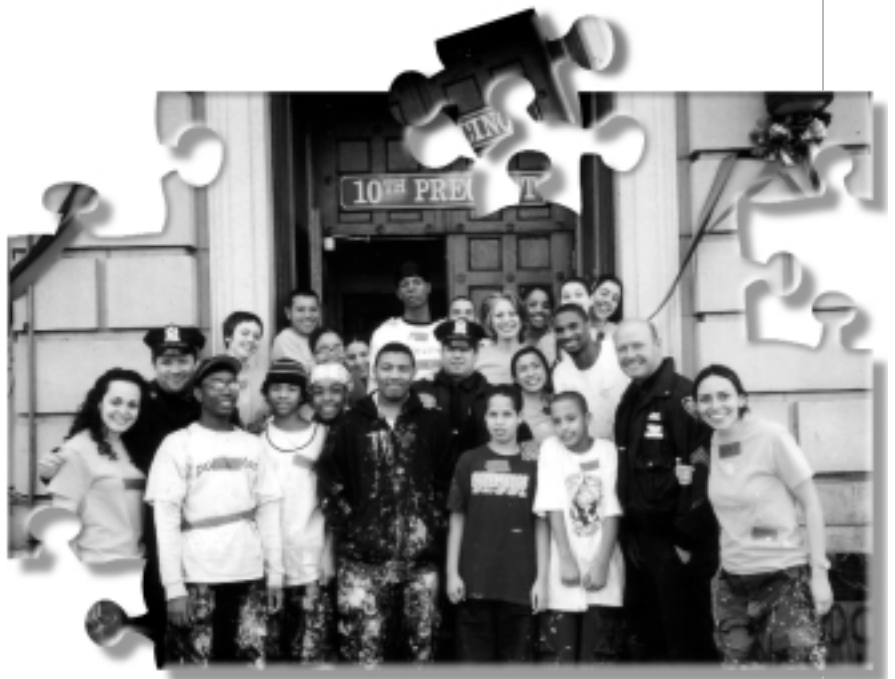
Publicolor trains and employs low-income minority adolescents in a professional painting corps to revitalize public spaces, often working with community volunteers on sites that include police stations, community centers, and health care facilities.

To help develop and institutionalize an enriched and coordinated BAM Internship Program $75,000