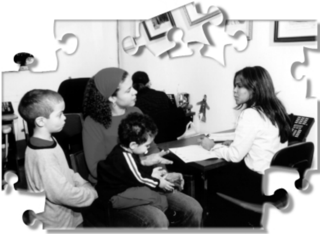
The Children's Aid Society, working with the other community-based Facilitated Enrollment agencies it coordinates with Altman Foundation support, connects families to health insurance by reaching them in their own neighborhoods and languages and during hours that are convenient to them.