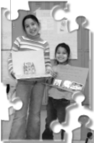
Children and families are encouraged to explore the links between books and art in workshops co-sponsored by the Literacy Assistance Center and St. Nicholas Neighborhood Preservation Corporation at their second annual Family Literacy Day.