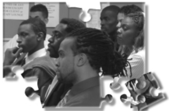
Henry Street Settlement has integrated all of its workforce development programs in an effort to strengthen practice and create cost efficiencies.