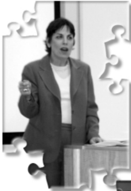
United Neighborhood Houses has joined forces with the Columbia Business School's Institute for Not-for-Profit Management to create and deliver a customized executive education program for middle managers who work in settlement houses citywide.

TOTAL GRANTS AUTHORIZED 2004: $10,225,300