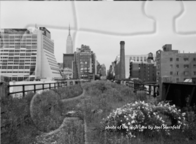
photo of the High Line