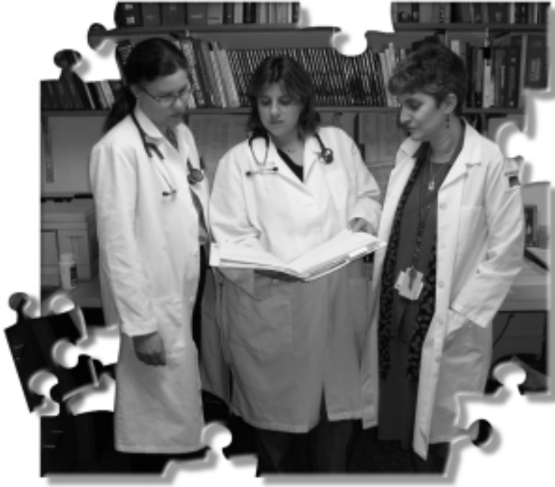
Clinical staff at all levels of the Intensive Care Unit and the Palliative Care Service at Montefiore Medical Center are collaborating to optimize pain management and palliative care for Montefiore's patients.