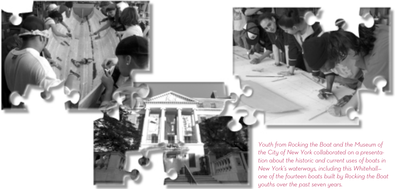
Youth from Rocking the Boat and the Museum of the City of New York collaborated on a presentation about the historic and current uses of boats in New York's waterways, including this Whitehall—one of the fourteen boats built by Rocking the Boat youths over the past seven years.