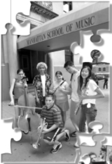
A partnership between public and private funders allows public school children to engage in an intensive, skill-based summer music program at Manhattan School of Music.