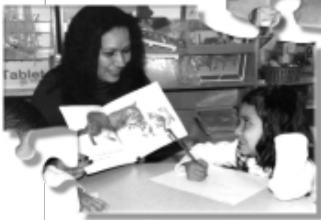
Learning Leaders, a private/public partnership, seeks to increase parents’ involvement in their children’s education and, in turn, to strengthen community involvement as well.