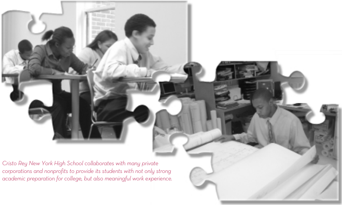
Cristo Rey New York High School collaborates with many private corporations and nonprofits to provide its students with not only strong academic preparation for college, but also meaningful work experience.